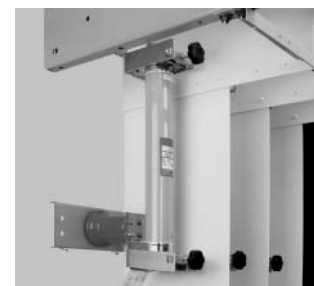
MVS-C Fuse Mounting

Fuse mountings: Complete three-phase fuse mounting assemblies or fuse live parts are available that are fully compatible with MVS-C switches. The fuse mountings are intended for use with Eaton's fuses.