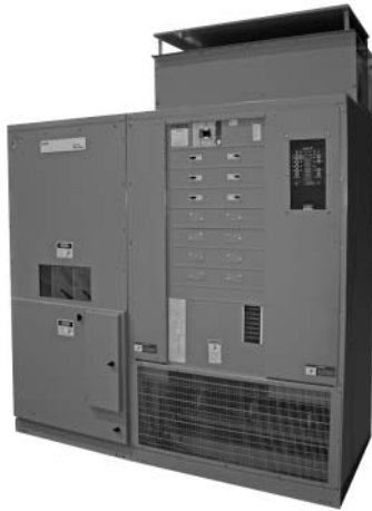
Bottom Cable Entry and Top Cable Entry