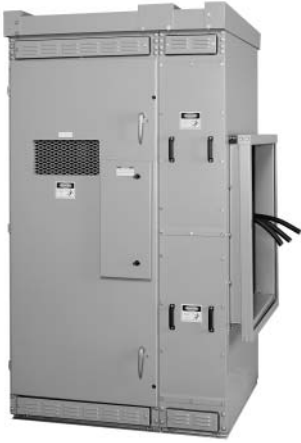
Outdoor Medium Voltage Switch—MVS Cable Connection to Liquid-Filled Transformer